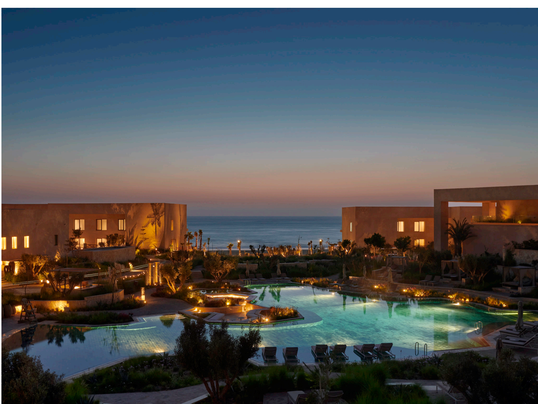
Fairmont Taghazout Bay Hotel and Residences, Morocco