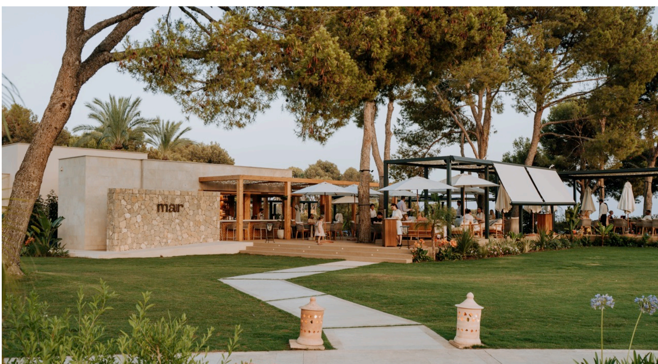
Mar Sea Club at St. Regis Mardavall, Mallorca