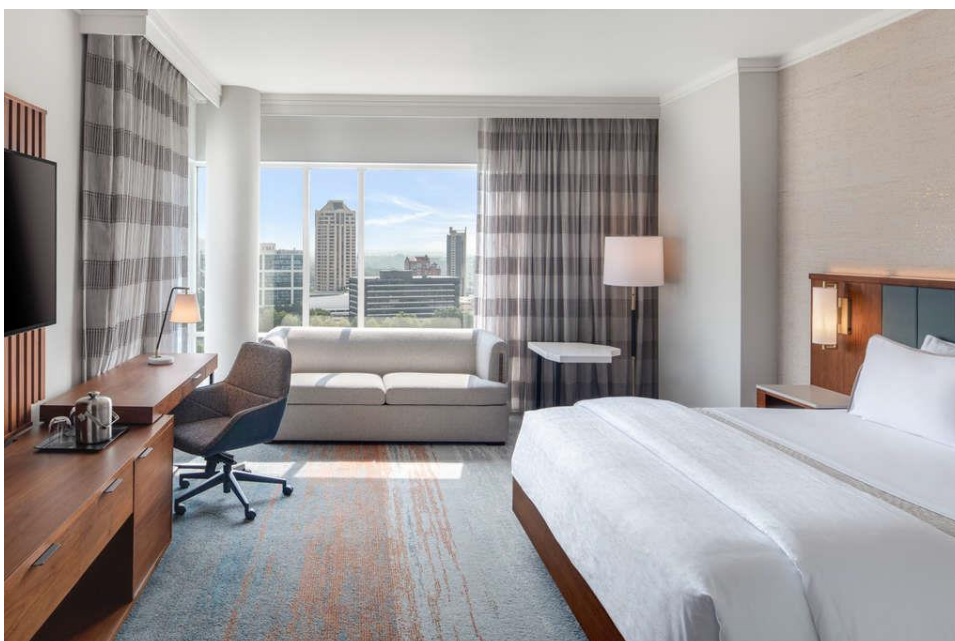
The Westin Buckhead Atlanta