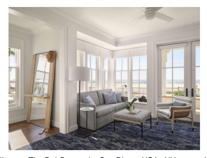
Beach Village at The Del Coronado, San Diego, USA.

Guided by the property's idyllic setting, exclusivity and personalised, elevated service, HBA Los Angeles' design for the 78 residential-style accommodations is a sophisticated tactile experience with a refined sense of aesthetic and the added embellishment of contemporised traditional detailing.