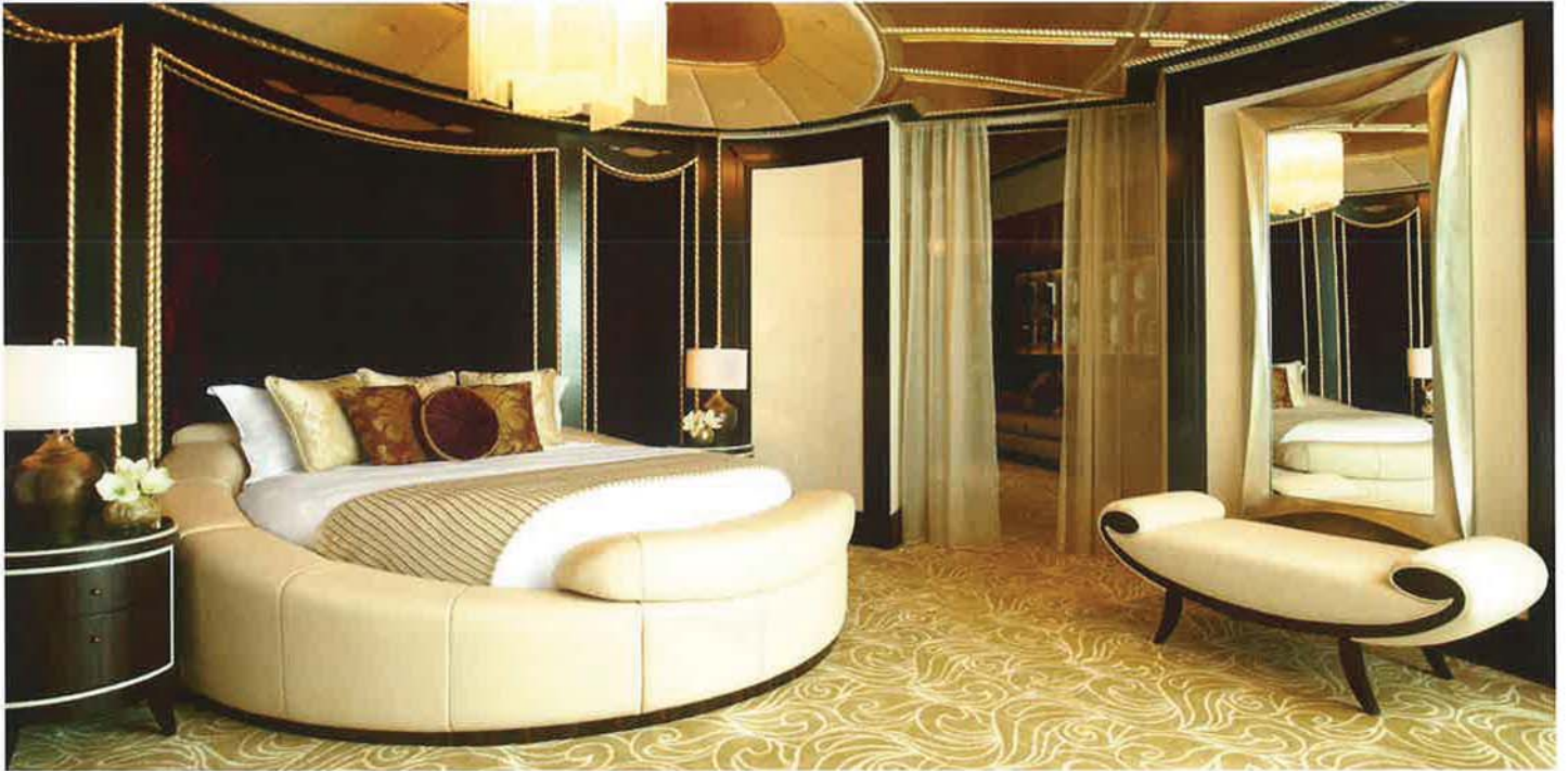
Above: The Abu Dhabi Suite sits 200 metres above ground, spanning the Nation Towers' skybridge Opposite Page (Top): The St. Regis Bar is divided into three spaces; a Library, a Bar and a Cigar Bar Bottom: The Abu Dhabi Suite features a Grand Drawing Room, complete with intricate glass dome and Deco detailing

the 21st century. "With the St. Regis Abu Dhabi, we aimed to create a sophisticated and modern environment that marries Arabic influences with the needs of global travellers," comments Mason. "Using local references, we were able to combine the elegant lines of Arabic design with stately and modernist Art Deco forms to create a unique stand-out hotel on par with the greatest hotels worldwide."