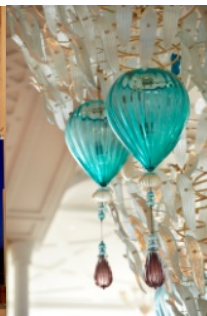
Peacock Alley Details