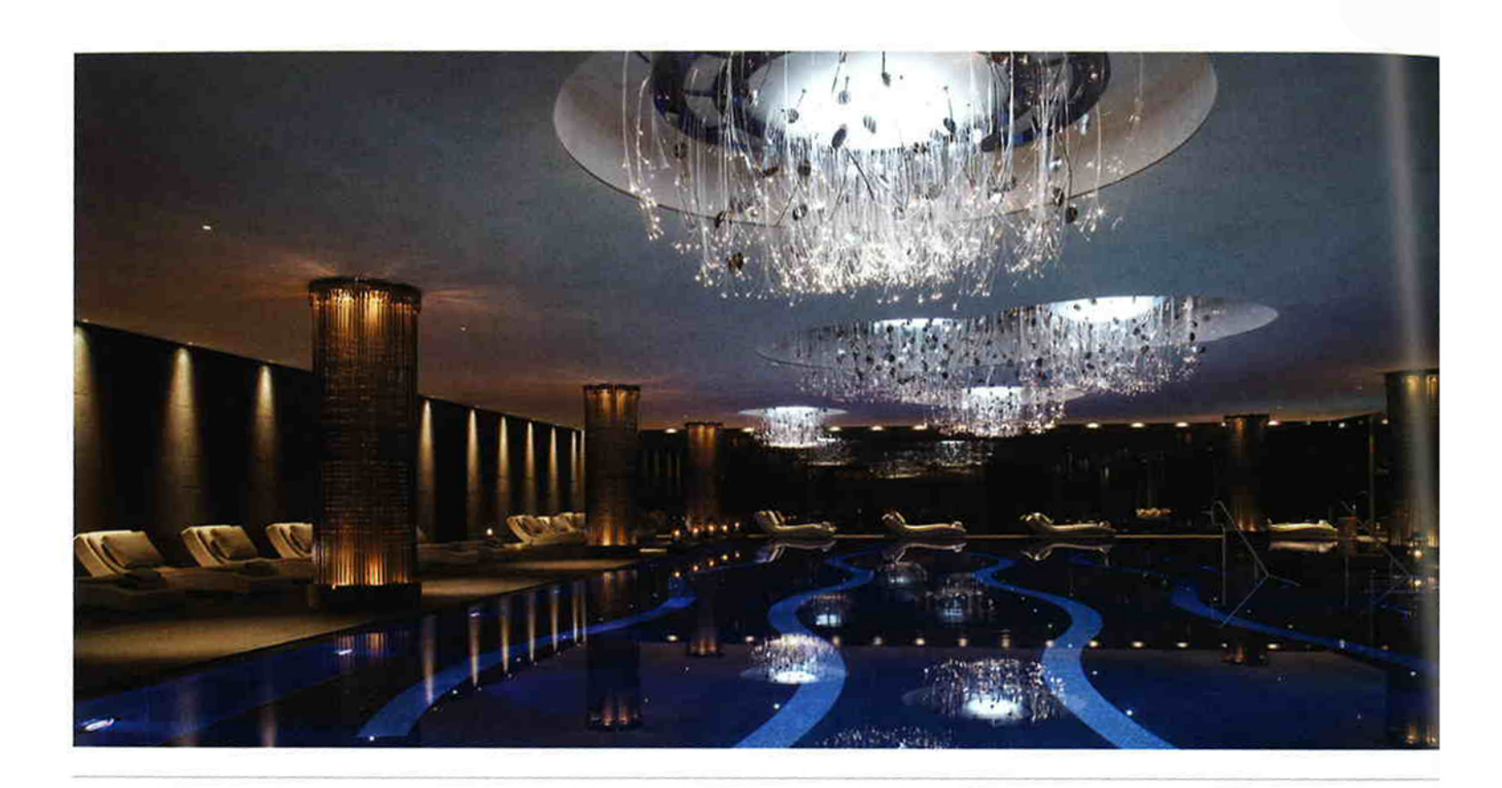
ABOVE: HBA's renovation of The Europe has seen the introduction of an ESPA spa incorporating a plunge pool, heat experience areas, various treatment rooms, and a private terraced suite

cut out from paper-thin bronze sheets suspended from the ceiling. Spa amenities are comprised on two separate levels. The first, or 'active', level contains a state-of-the art fitness, kinesis and Tai Chi studio. This level features "opalescent silk wall coverings and jewel-like creamish grey accents that contrast with the dark and opulent relaxation areas." Here, the hardness of the black stonewall, dappled with niches for candlelight, is complemented and softened by velvet throws and soft pillows, while custom-designed bespoke relaxation beds surrounded by slat sail-like screens offer privacy and comfort.